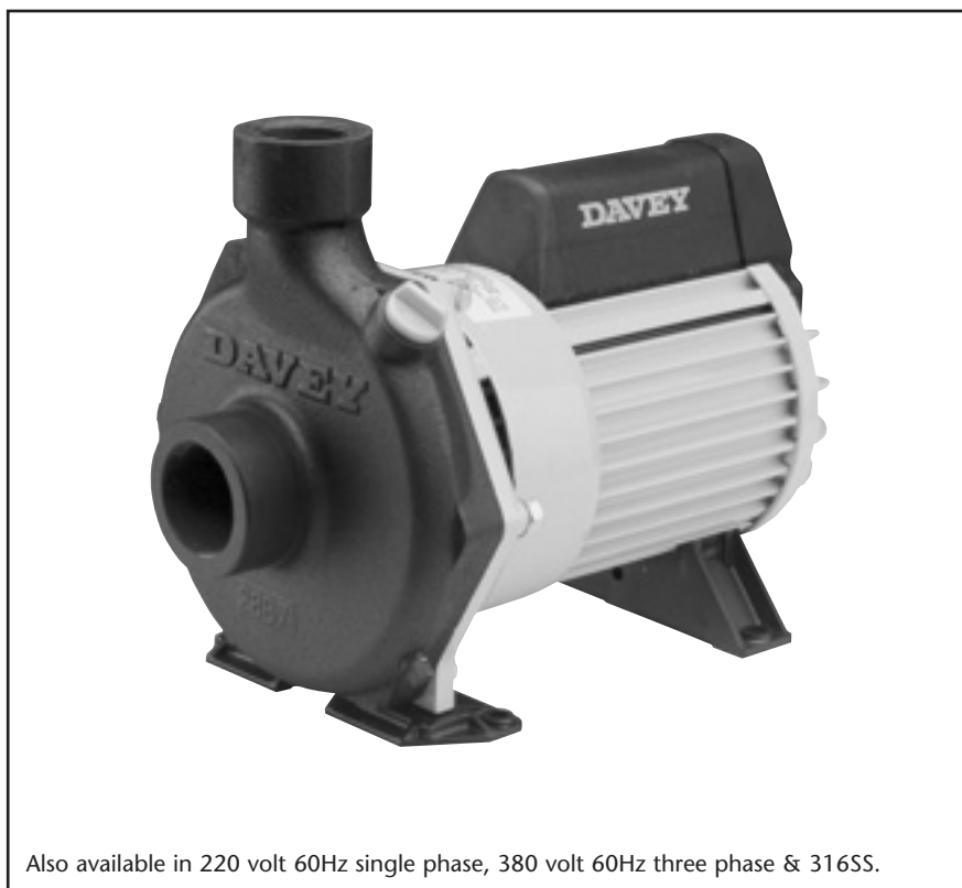
Also available in 220 volt 60Hz single phase, 380 volt 60Hz three phase & 316SS.